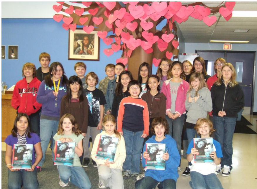
Grade 5 - 8 students in front of the Tree of Life