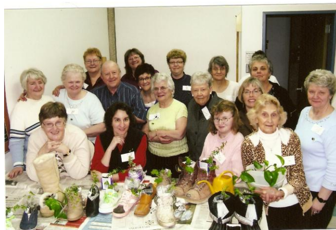
The ladies pose with their plants